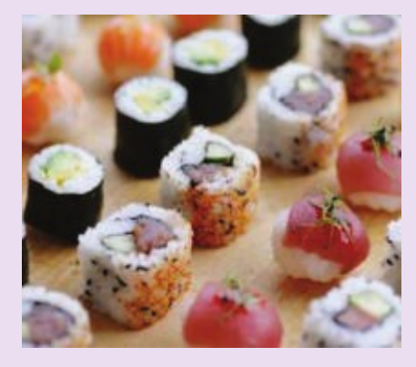
To tempt your taste buds, a few ideas from Teatro....

If you wish to bring in your own caterer, The Radlett Centre is happy to include the use of our professional kitchen facilities without additional charge.